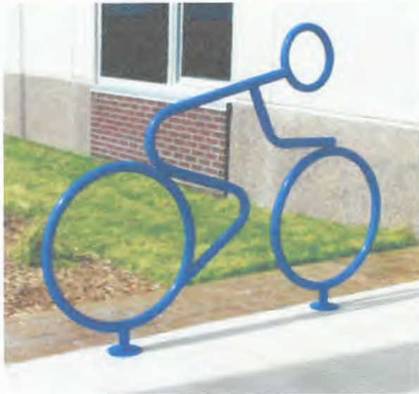
Model BIKEBR-SF | Blue