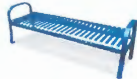
Premier Serenity Style Backless Bench